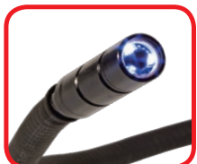
10mm Camera with LED Lights