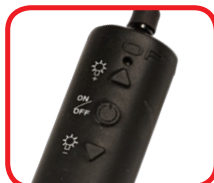
LED Dimmer Control