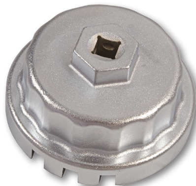
PBT71113 6 & 8 CYLINDER OIL FILTER WRENCH