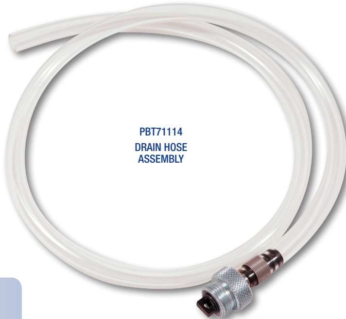
PBT71114 DRAIN HOSE ASSEMBLY