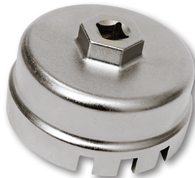
PBT71110 4 CYLINDER OIL FILTER WRENCH