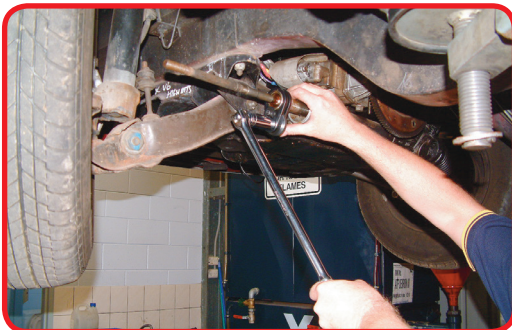
Cam design increases force as load is applied

Prevents damage to rack components. Use for removal or installation