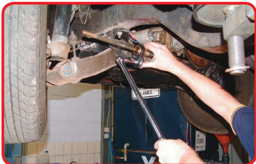
Cam design increases force as load is applied

Prevents damage to rack components. Use for removal or installation