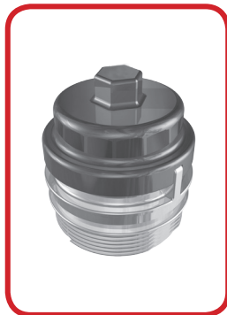
64.5mm WITH 14 FLUTES