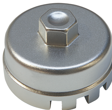
PBT71110A 4 CYLINDER