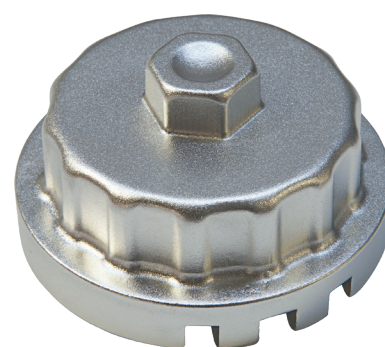
PBT71113A 6 & 8 CYLINDER