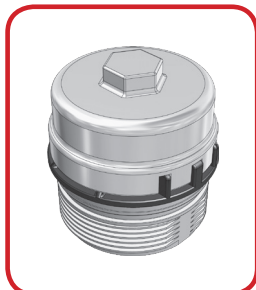
64.5MM WITH 14 FLUTES