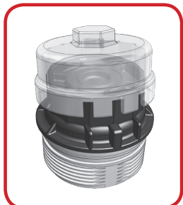
24MM (15/16") HEX