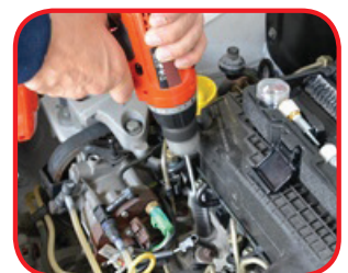
Use cordless drill to drive cleaning brushes