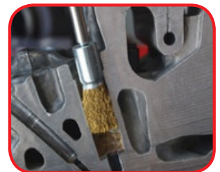
Use to clean injector seat area